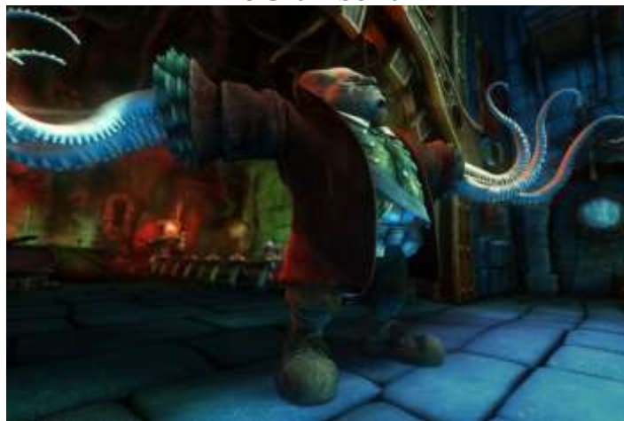
The ogre becoming an octopus