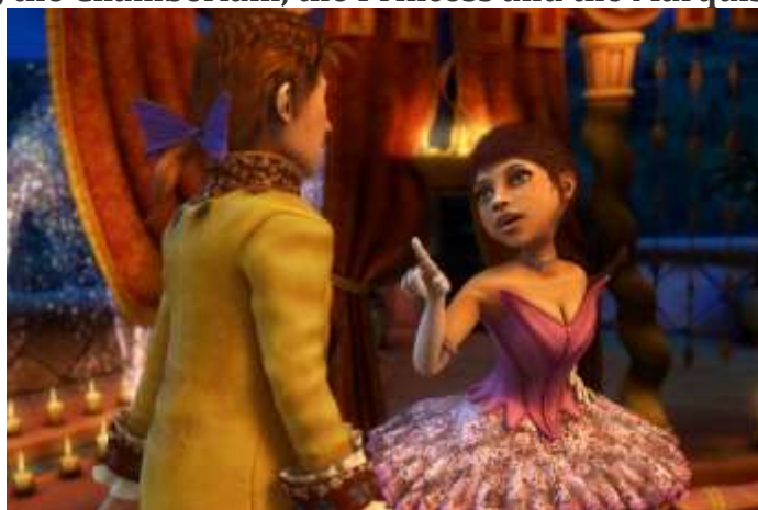
The Princess and the Marquis de Carabas