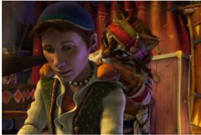
P'tit Pierre and the cat