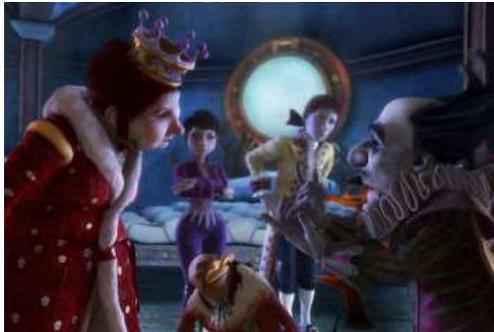
The Queen, the Chamberlain, the Princess and the Marquis de Carabas