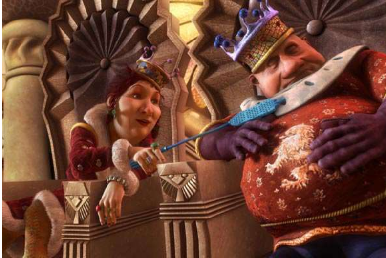
The Queen and the sleepy King